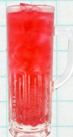
Iced Hale's sala soda