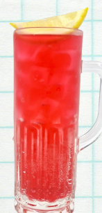
Ice Hale's sala lemon soda