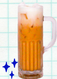
Thai milk tea

Our milk drinks contain - condensed milk and evaporated milk