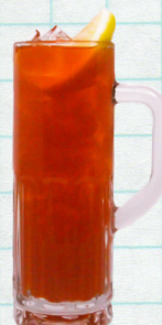
Iced lemon tea